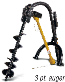
3 pt. auger