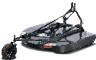
3 pt. rotary cutter