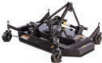
3 pt. finish mower