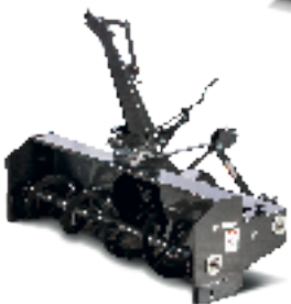
3 pt. snowblower