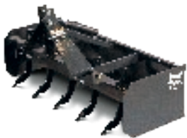
3 pt. box blade