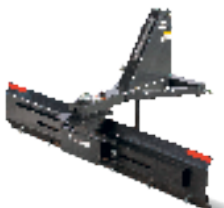
3pt. angle blade