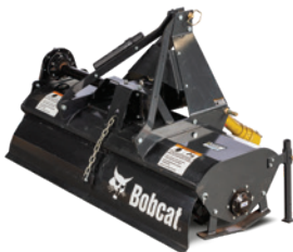
3 pt. tiller