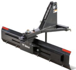
3 pt. angle blade