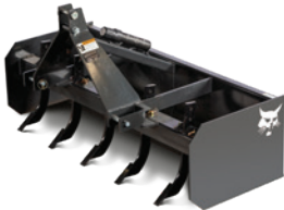
3 pt. box blade