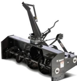
3 pt. snowblower