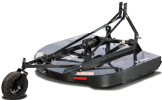
3 pt. rotary cutter