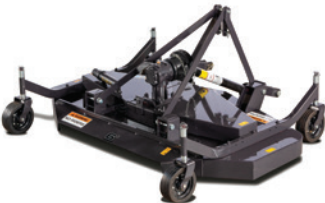
3 pt. finish mower