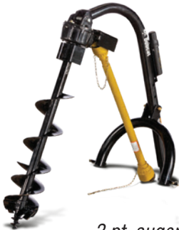
3 pt. auger